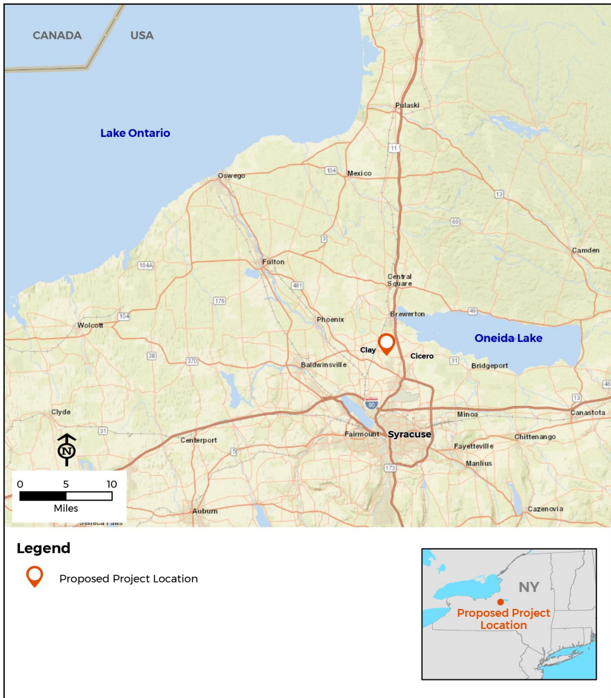
FIGURE 1 VICINITY MAP