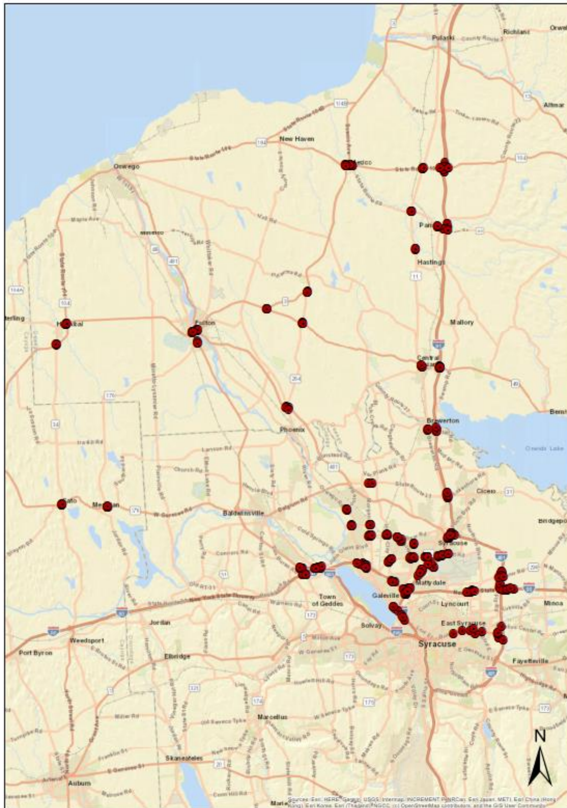
FIGURE A-2 AUTOMATIC TRAFFIC RECORDER LOCATIONS