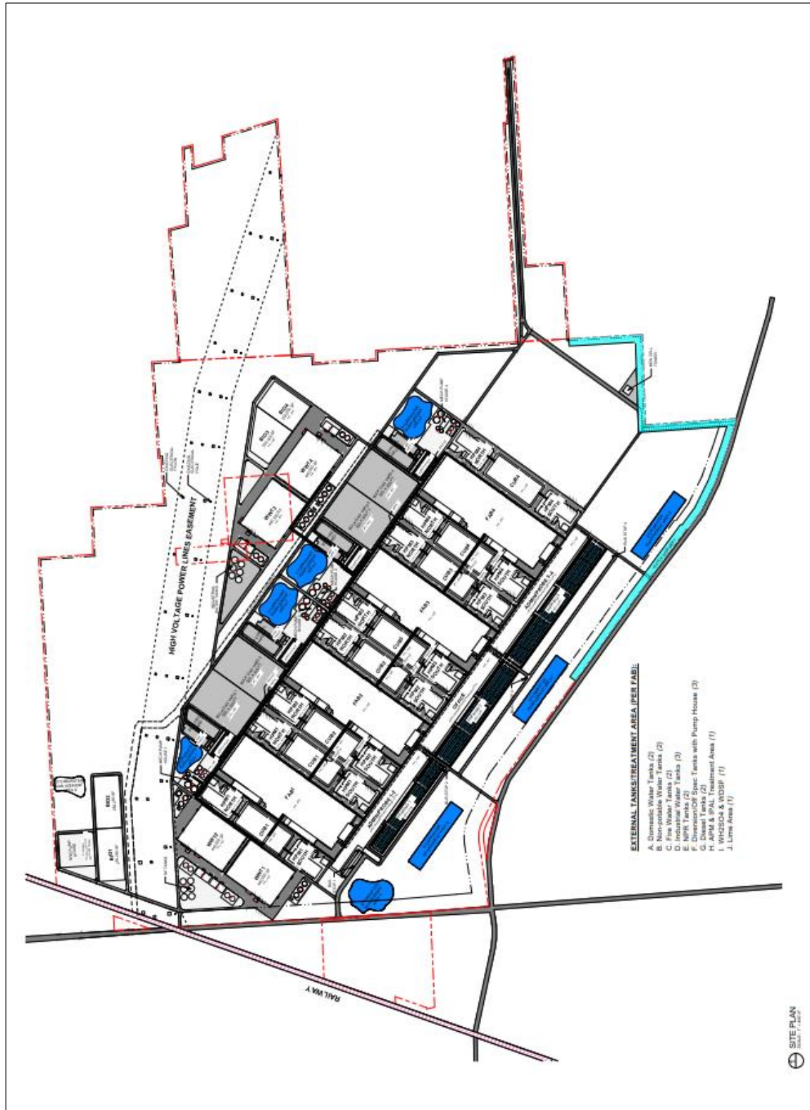
FIGURE 3 PROPOSED SITE PLAN FOR MICRON CAMPUS