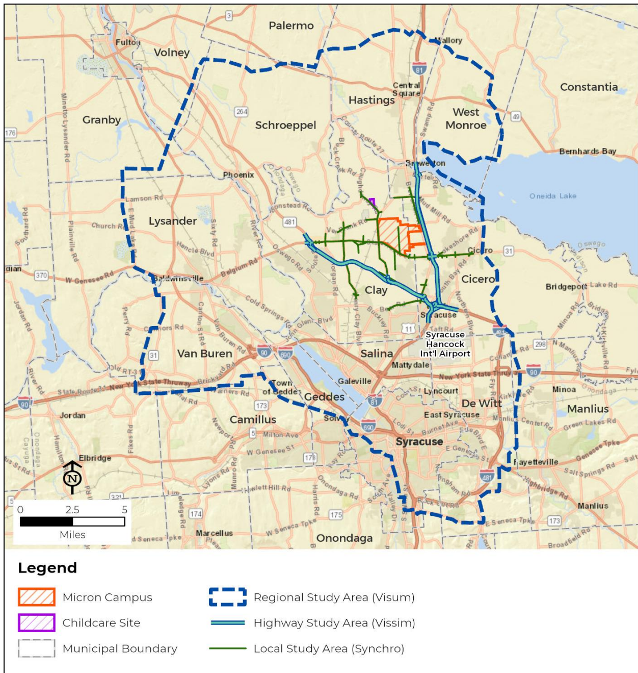
FIGURE A-1 TRAFFIC STUDY AREA