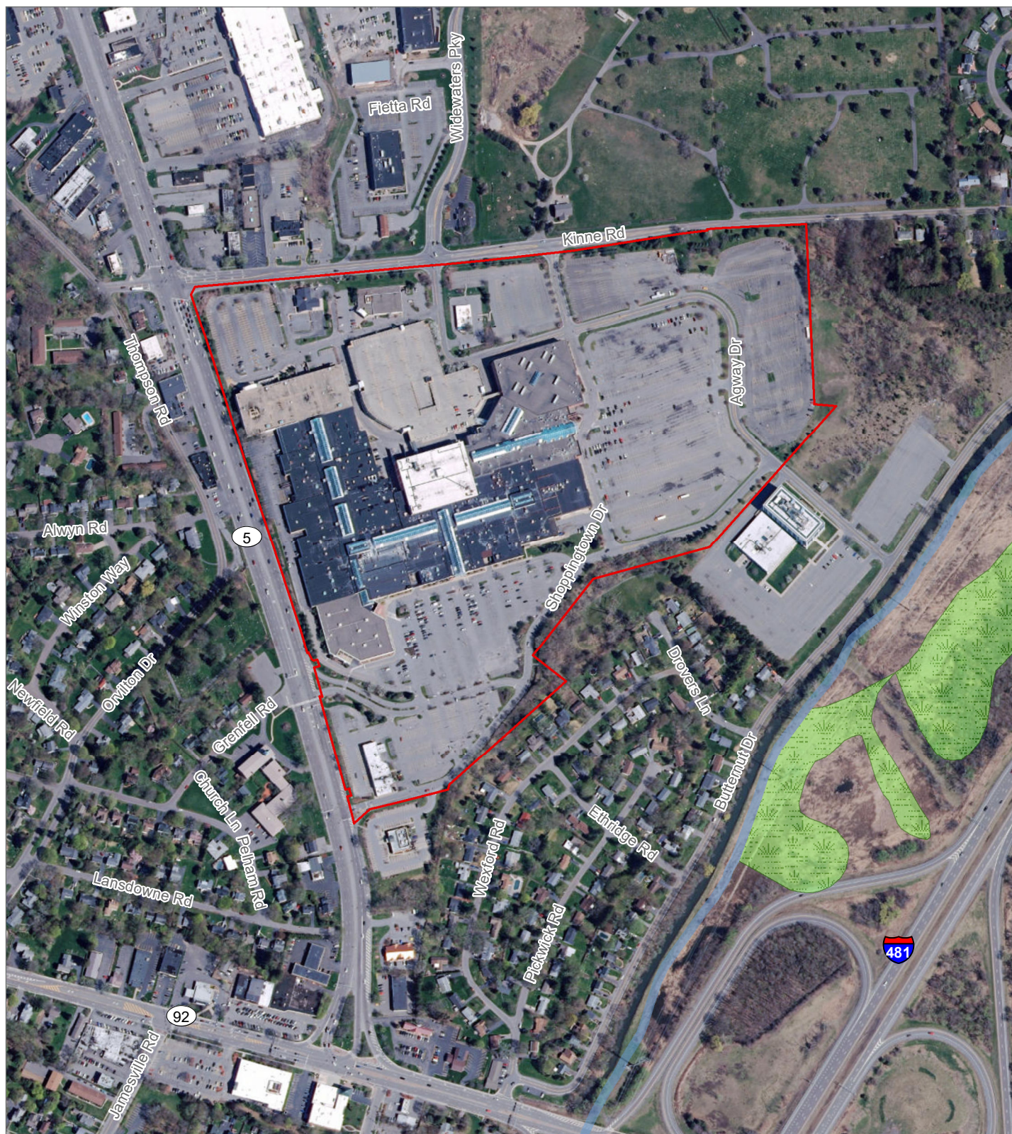
Figure 1. NWI Mapped Wetlands